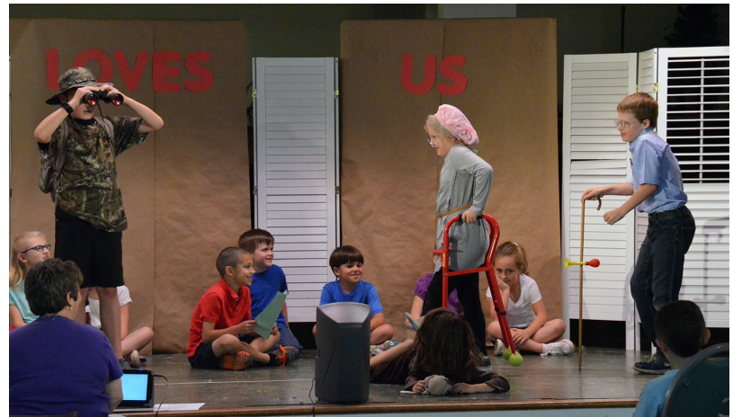
The Spirit Singers (Grades 1-3) presented their program on May 17.