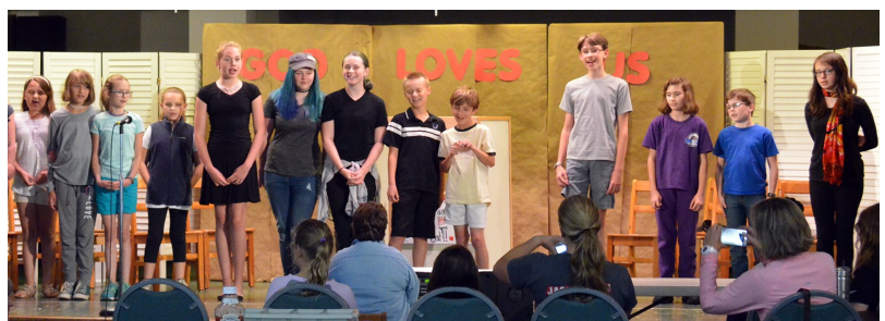
The God Squad (Grades 4-6) presented their program on May 24.